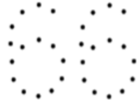
books in the whole Bible