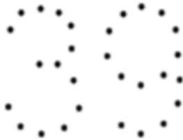
books in the Old Testament

Connect the dots to find out how many books are in the Bible.