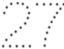
books in the New Testament