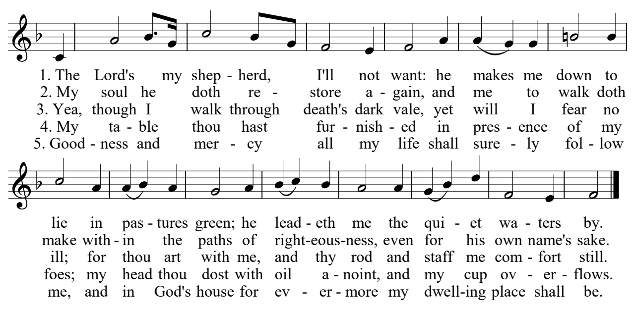
Psalm 23 Paraphrase: #519 (Common Praise) "The Lord's My Shepherd"