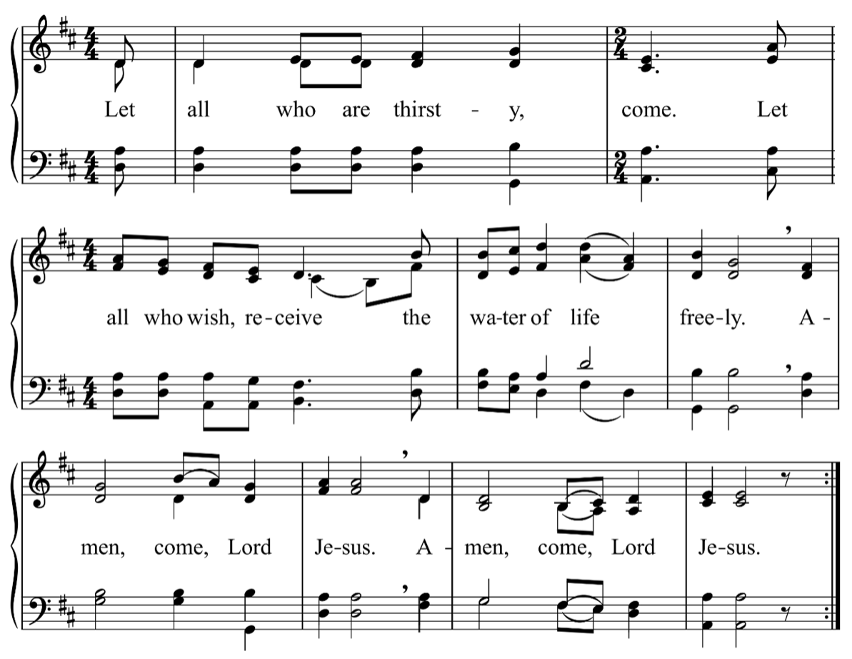
Text: Taizé Community. Tune: Taizé Community © 2011, Les Presses de Taizé, GIA Publications, Inc., agent.