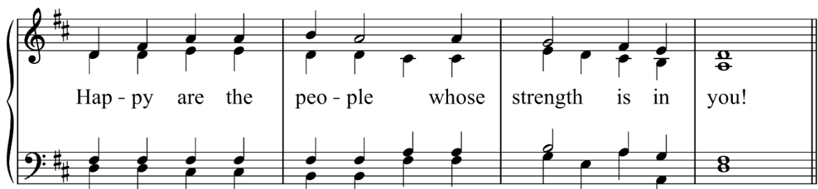
How dear to me is your dwelling, O God of hosts! My soul has a desire and longing for your courts; my heart and my flesh rejoice in you, O living God. Refrain

The sparrow has found her a house and the swallow a nest where she may lay her young; by the side of your altars, O God of hosts, my God who reigns over me. Refrain